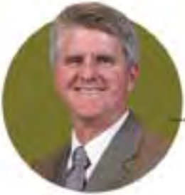
Reno Zunz Family Care and Missions