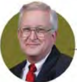
Norm Childers Senior Adults